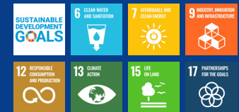
Our commitment to the UN SDGs

All three of our sustainability pillars share a common commitment to SDG 17: Partnership for the goals. We know that it is only by working together with our customers, suppliers and other stakeholders that we can lead the sustainability transformation and drive the most meaningful positive change.