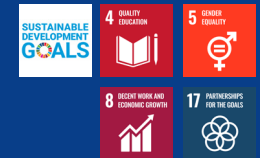
Our commitment to the UN SDGs

We protect and enable our employees, promoting growth and development for all, and driving actions to ensure a diverse workforce and an inclusive culture. This contributes to SDGs 4, 5 and 8. We also work to protect and support communities where we and our suppliers operate, including securing a responsible value chain that protects human and labour rights, further contributing to SDG 8.